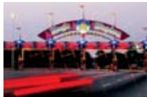
1. Drive and park the car