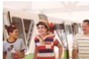
2. Ride the tram, monorail or bus to the Theme Park