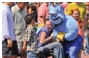
7. Have some fun!