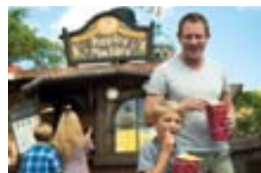
8. Get your favorite snack