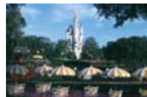
9. Take a break