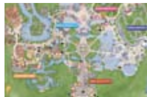
5. Study the map