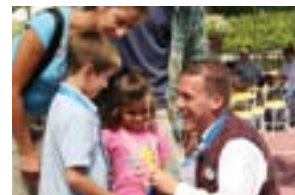
6. Visit Guest Relations